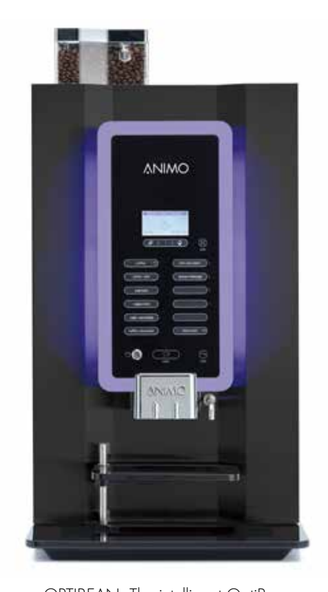
OPTIBEAN: The intelligent OptiBean espressomachine with ready-to-go push button panel. For those who like to push a button, a perfect espresso is just one press away.