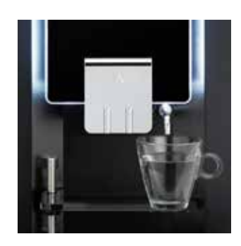
Separate tap for hot water