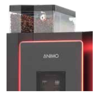
+ Fresh coffee beans

Love a bigger, fuller cup? In addition to OptiBean, OptiBean XL is equipped with an extra large espresso brewing system.